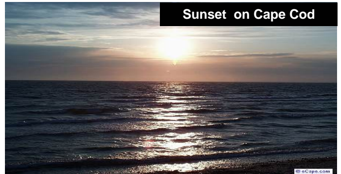
Sunset on Cape Cod