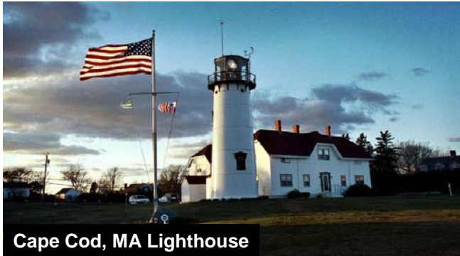
Cape Cod, MA Lighthouse

Deposit $100. per person plus Travel Insurance premium, if purchased; Full Payment due 75 days prior to departure