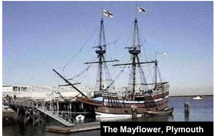
The Mayflower, Plymouth