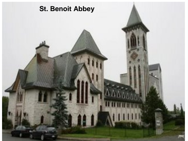
St. Benoit Abbey