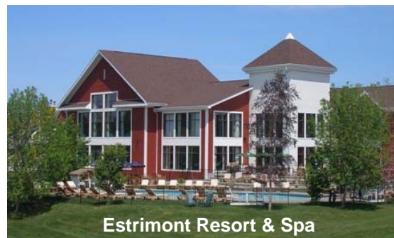
Estrimont Resort & Spa

Treat yourself to an incomparable experience at the beautiful Estrimont Resort & Spa . Luxuriate in your own mini-suite and savor the Resort's award-winning cuisine. Complimentary resort amenities include 4 outdoor hot tubs facing Mt. Orford, dry sauna, polar bath, outdoor pool, indoor pool and exercise room. Spa treatments and other resort facilities are available at additional charge.