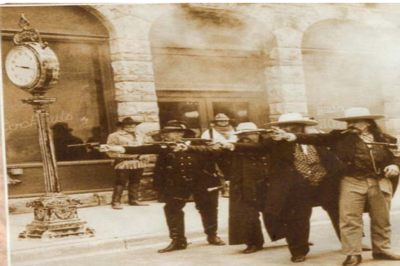
Your Welcome to Deadwood